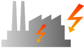
Internal and external threats

Have you done everything to ensure that your information are always available and up-to-date, cannot be manipulated, are not lost or fall into wrong hands?